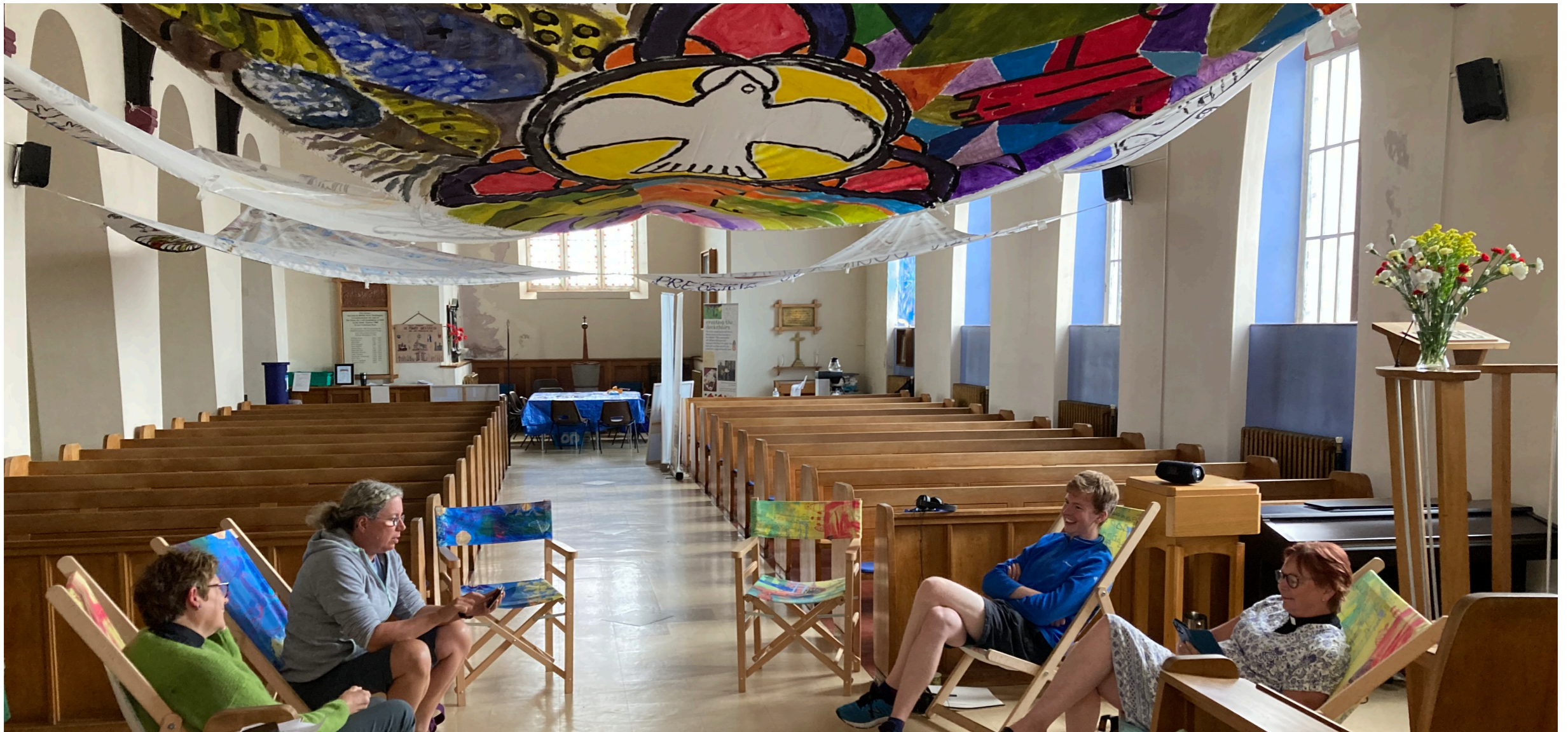
Carlisle Cathedral "Under the Stars" project at St Mary's, 2025

Thank you for considering this post. An application form can be found on the website of the Diocese of Carlisle: