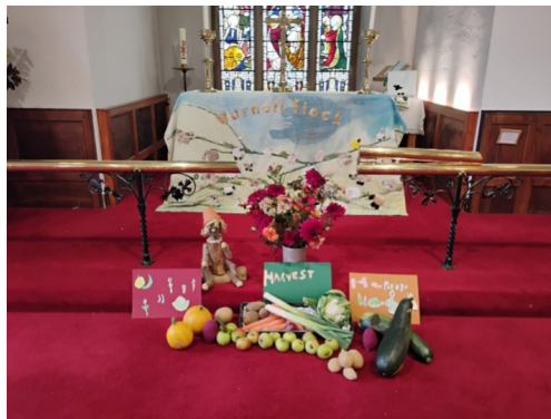
Harvest with the Warnell Flock frontal