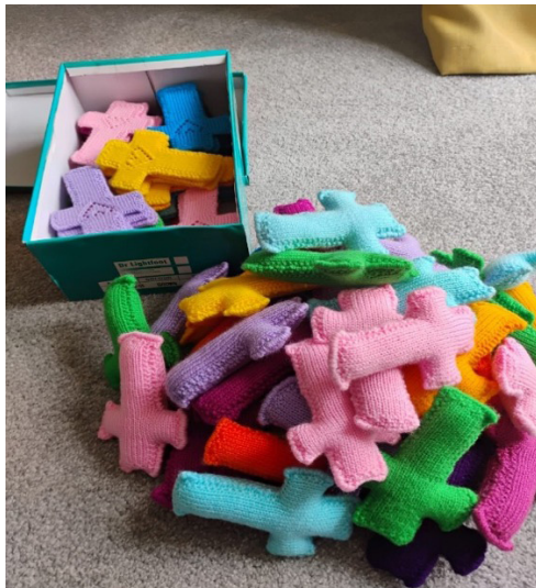
Some of the crosses knitted for the children by one of our Parishioners

The PCC are proactive in organising regular community events such as coffee mornings, bring and buy sales, music nights and quiz nights. As part of our mission community we have extended invitations to other churches in the Solway plain which have been well supported. Again, as part of mission community the PCC organised a “free clothes swap” in church for schoolchildren. This year our retiring priest in charge blessed hand made knitted crosses to give to every child (and teacher !!) at the start of school term.