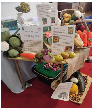
Children's Harvest table in church