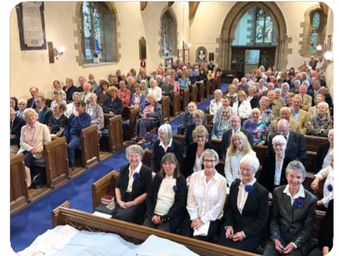
Recent joint service in St. Mary's, Crosthwaite

The Two Valleys Parish News monthly magazine is distributed to 630 households throughout the Mission