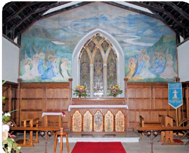
St John's Chancel

The present All Saints Church was built in 1869. It is the third church on the same site, with the first recorded dating from 1547. Reordering in 2015 added a kitchen, toilet and new heating and lighting; comfortable chairs replaced some pews, providing a good venue for community events, such as a regular poetry group and a very successful Harvest lunch immediately following the service. St John's, built in 1726, retains its original simplicity despite changes over the years, again including a kitchen and toilet. Its stunning location, peacefulness and unique war-memorial painting attract thousands of visitors each year, giving us a strong outreach mission