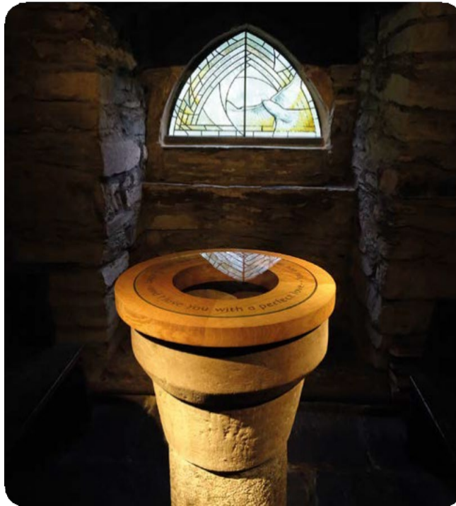
Cartmel Fell new window and font

In 2009 a new roofing and lighting project was completed, while in 2014 a fitted kitchen and WC were added discreetly to the church building. In 2017 an inspirational stained-glass window was added to the