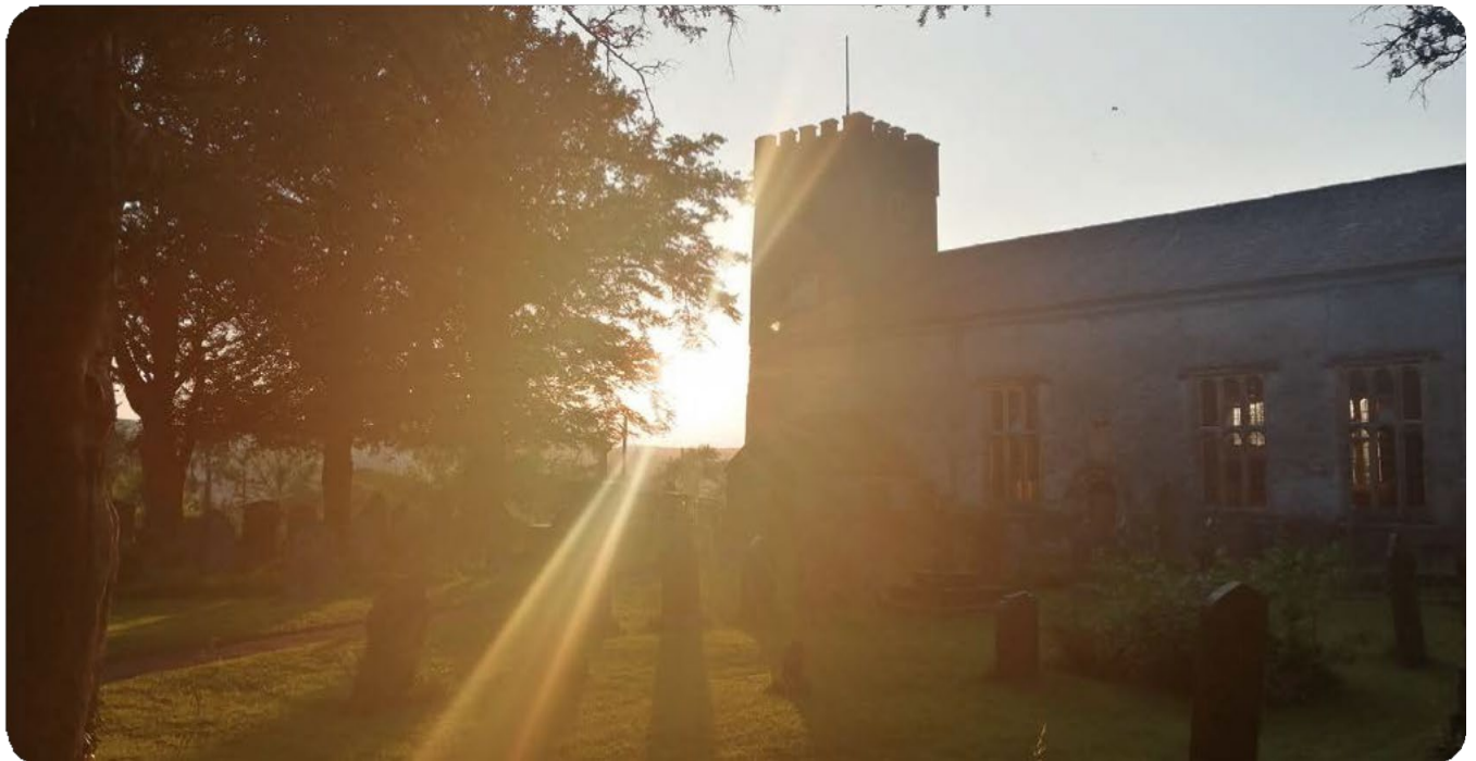
St Paul's Church, Witherslack

The services are traditional BCP, delivered in a warm, friendly, relaxed way, with after-service refreshments. The services are fortnightly, so on alternate Sundays we attend services at other churches in the Mission Community. This has proved to be a great success for our church, encouraging us to make new friendships and forge enjoyable links, in particular with our neighbouring parish of Crosthwaite.