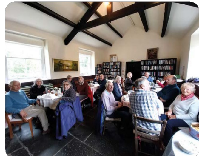
Winster Old School picnic