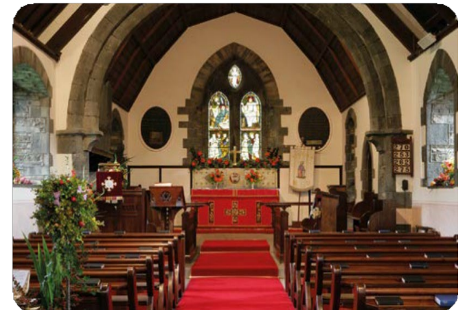
Winster Church interior

Adjoining the churchyard is a small original school house, known as the Old School, which now belongs to the PCC. While still retaining many of the original features, it