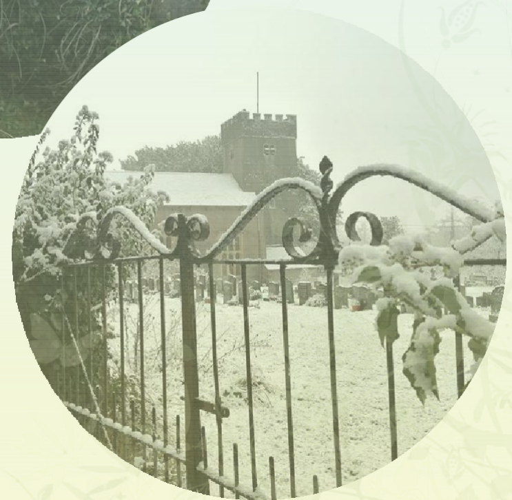
Witherslack throughout the seasons