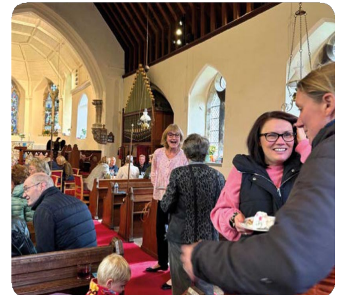
Underbarrow Harvest Festival lunch

The present All Saints Church was built in 1869. It is the third church on the same site, with the first recorded dating from 1547. Reordering in 2015 added a kitchen, toilet and new heating and lighting; comfortable chairs replaced some pews, providing a good venue for community events, such as a regular poetry group and a very successful Harvest lunch immediately following the service. St John's, built in 1726, retains its original simplicity despite changes over the years, again including a kitchen and toilet. Its stunning location, peacefulness and unique war-memorial painting attract thousands of visitors each year, giving us a strong outreach mission