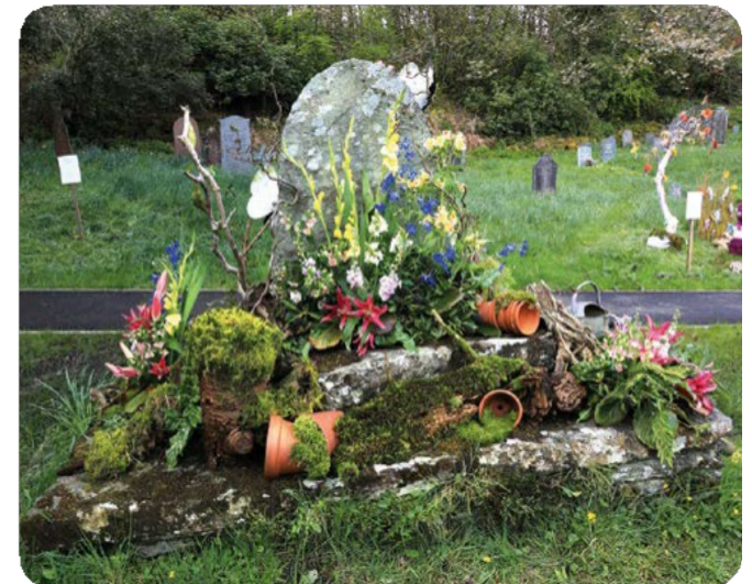
Cartmel Fell Flower Festival

The church has held two Flower Festivals over the last 10 years, showcasing the tremendously creative talent in the local area. The whole ambience of the church, and its surroundings, form a wonderful oasis of beauty and calm, attracting many visitors by car and on foot.