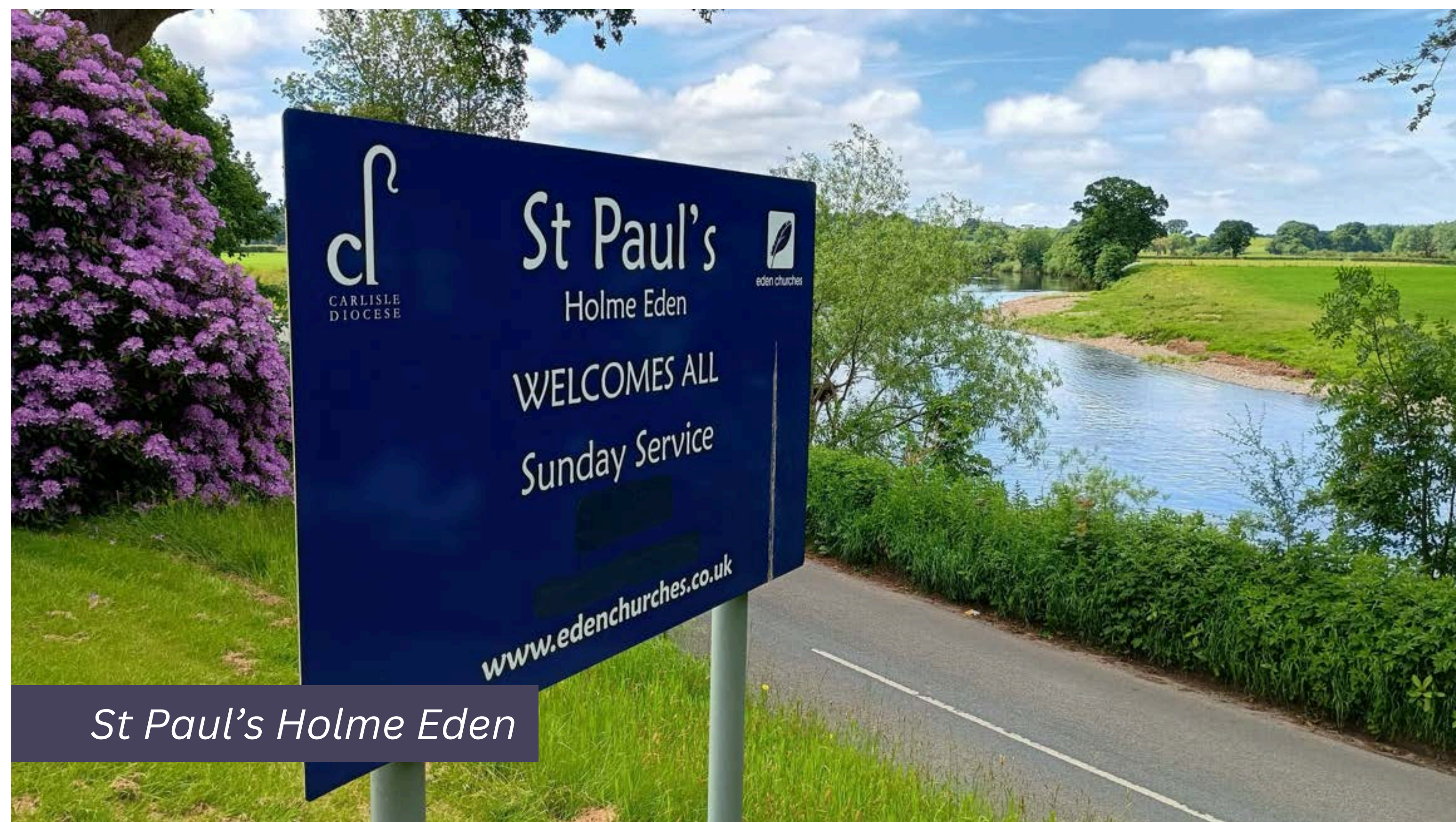
St Paul's Holme Eden