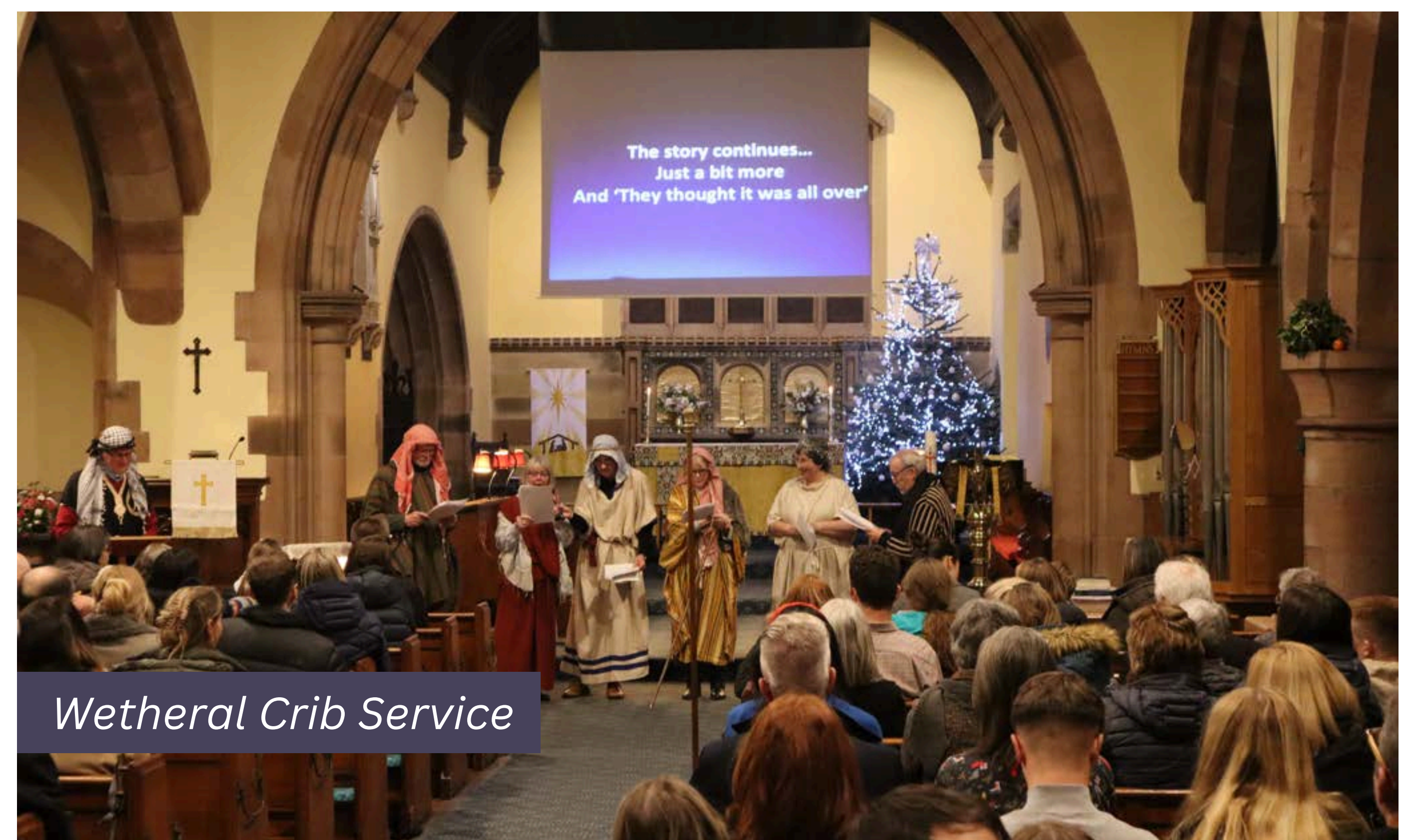
Wetheral Crib Service