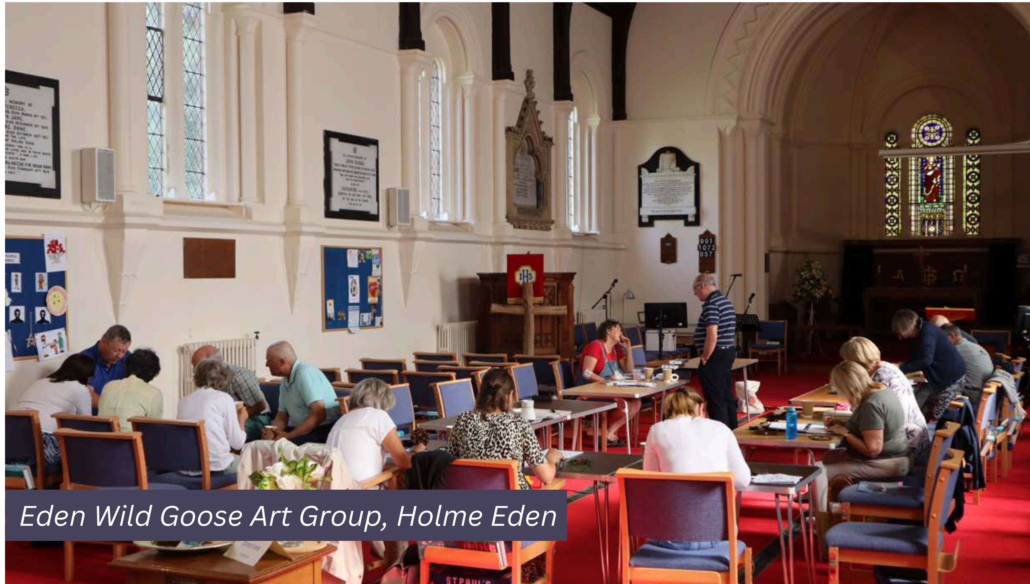
Eden Wild Goose Art Group, Holme Eden