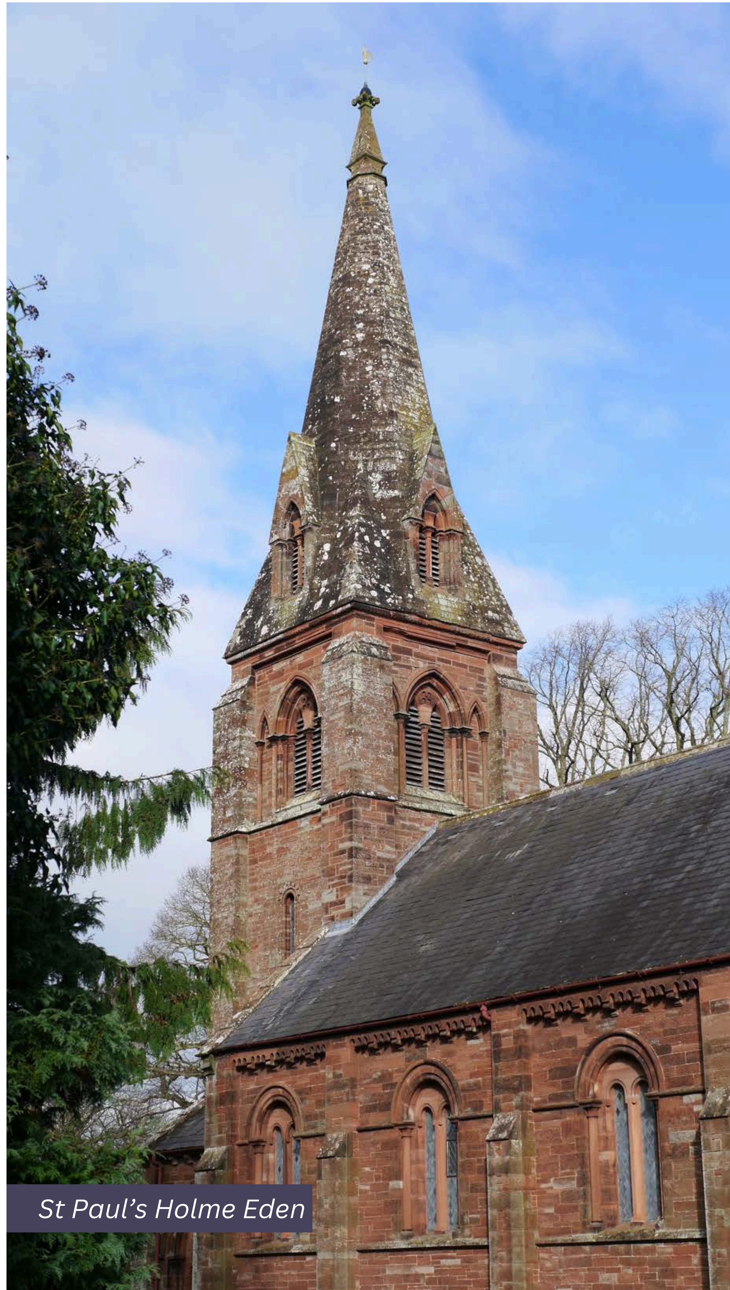
St Paul's Holme Eden