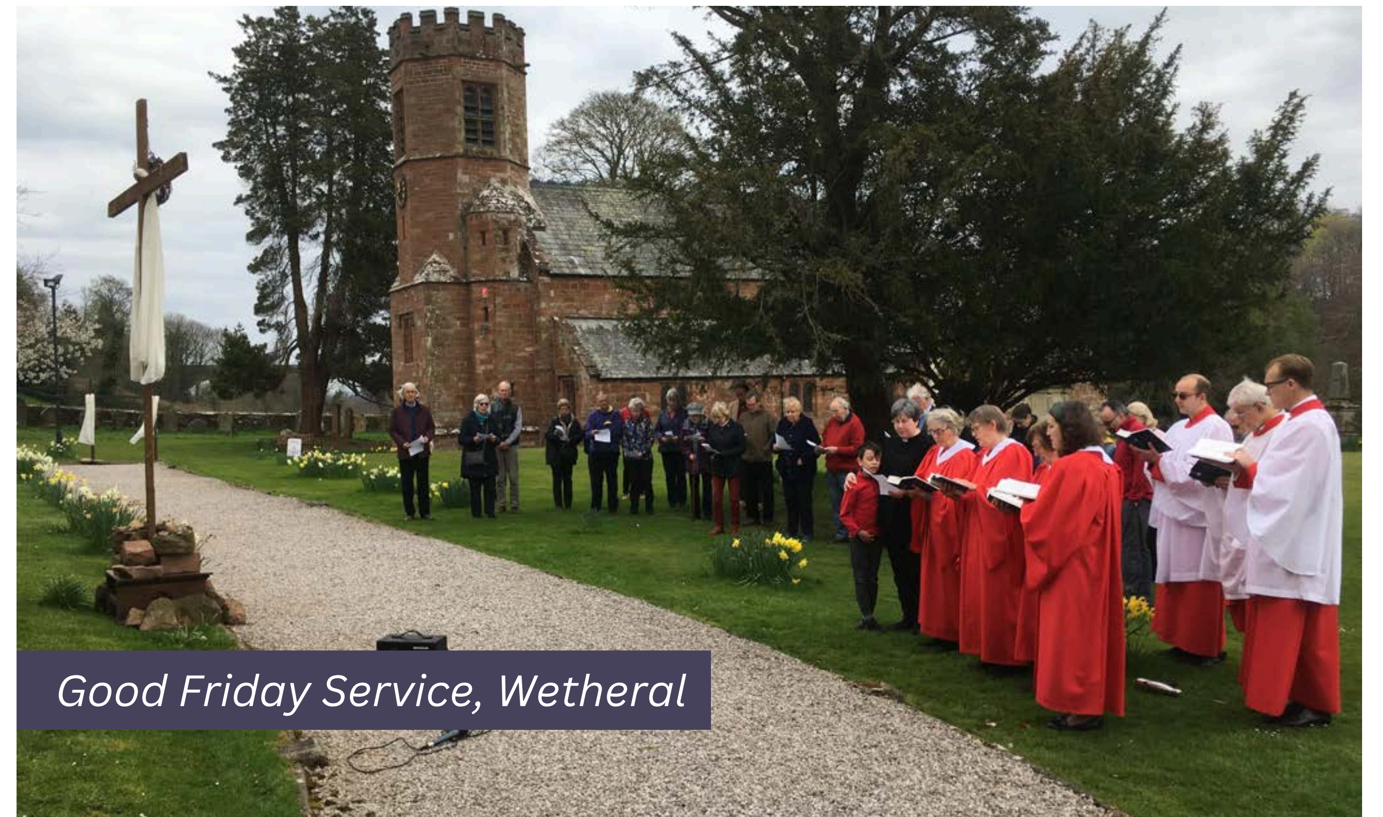
Good Friday Service, Wetheral

The 11.15am Holy Communions, plus some evensongs and special services, are followed by refreshments (which can get quite elaborate on special occasions!) provided and served by members of the choir.