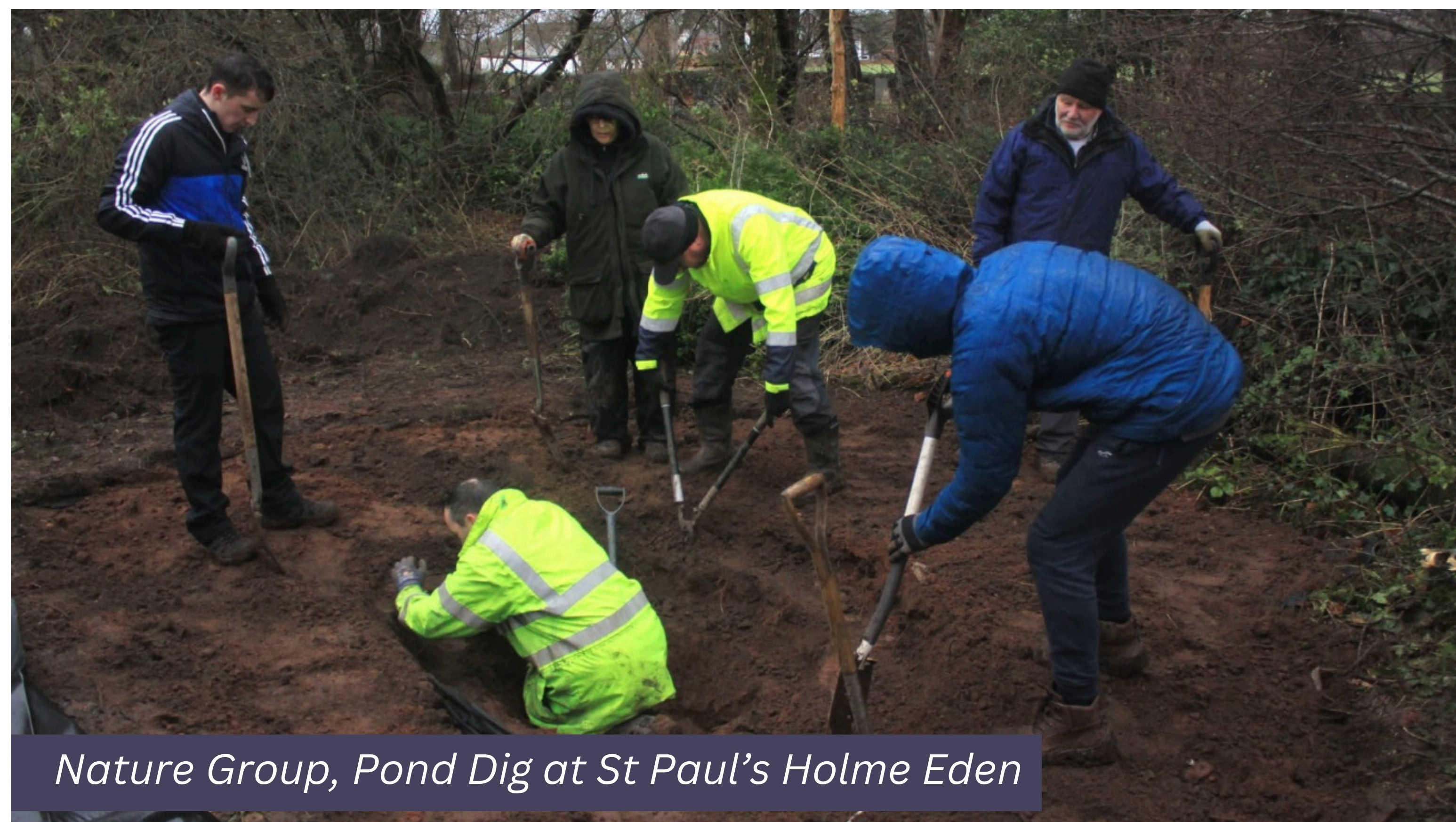
Nature Group, Pond Dig at St Paul's Holme Eden