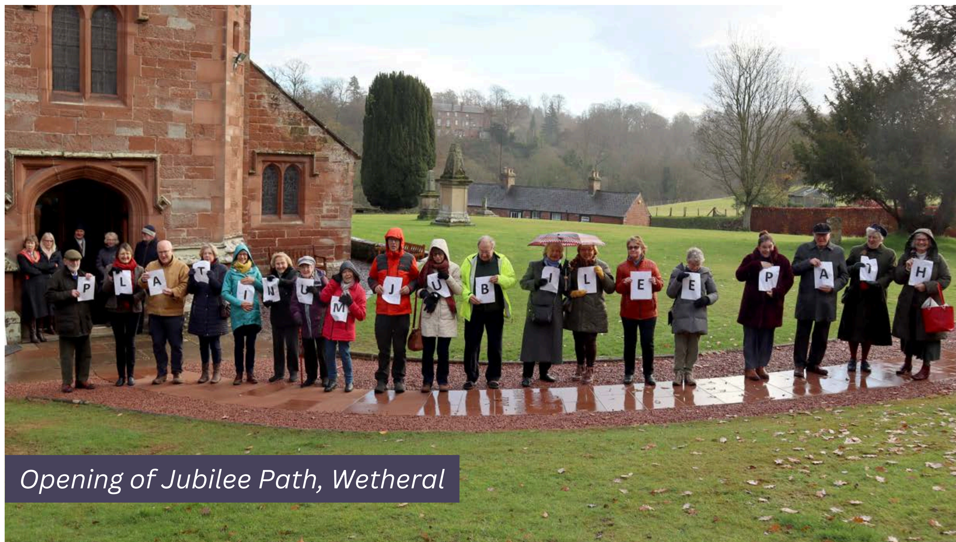
Opening of Jubilee Path, Wetheral