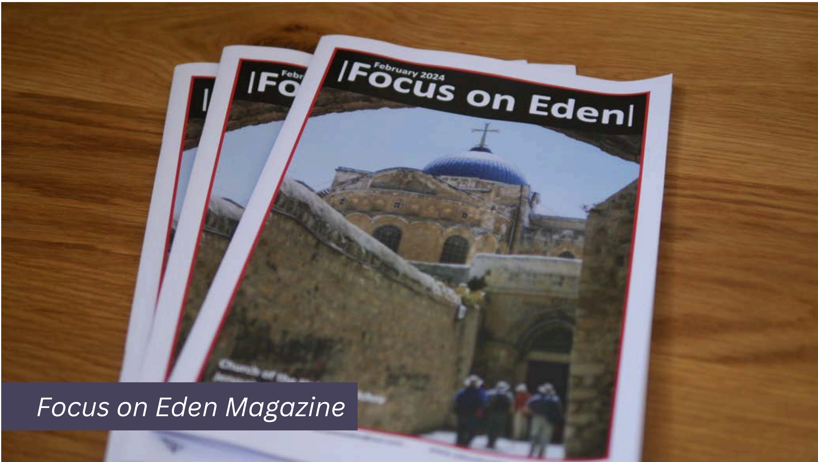
Focus on Eden Magazine

Carlisle Diocese has very recently agreed to subscribe to the National Church “Parish Giving Scheme”, given the much improved costs of membership. Our PCCs can consider joining this in due course, after an initial Diocesan trial has been achieved and it then may go on general release.