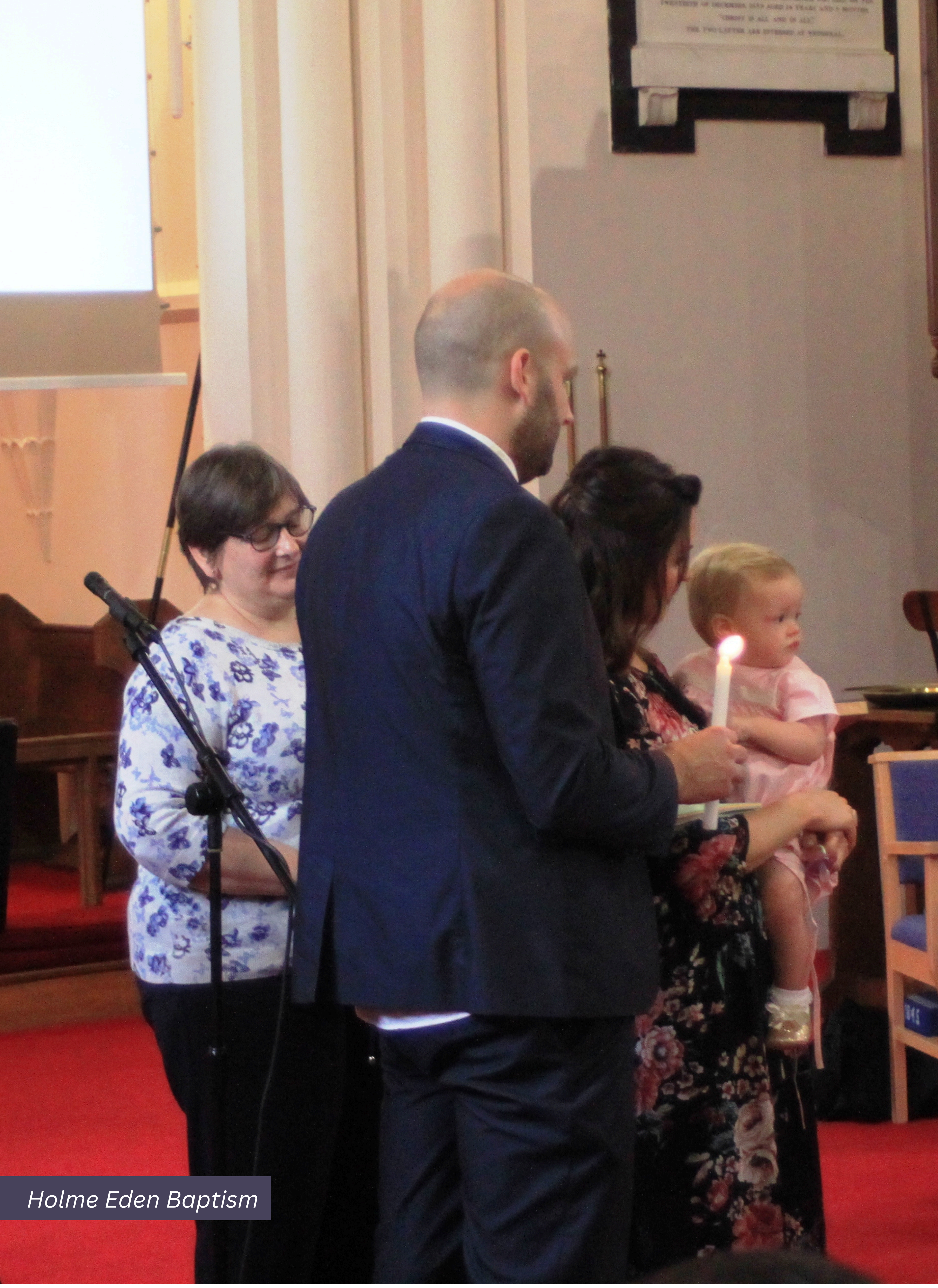
Holme Eden Baptism