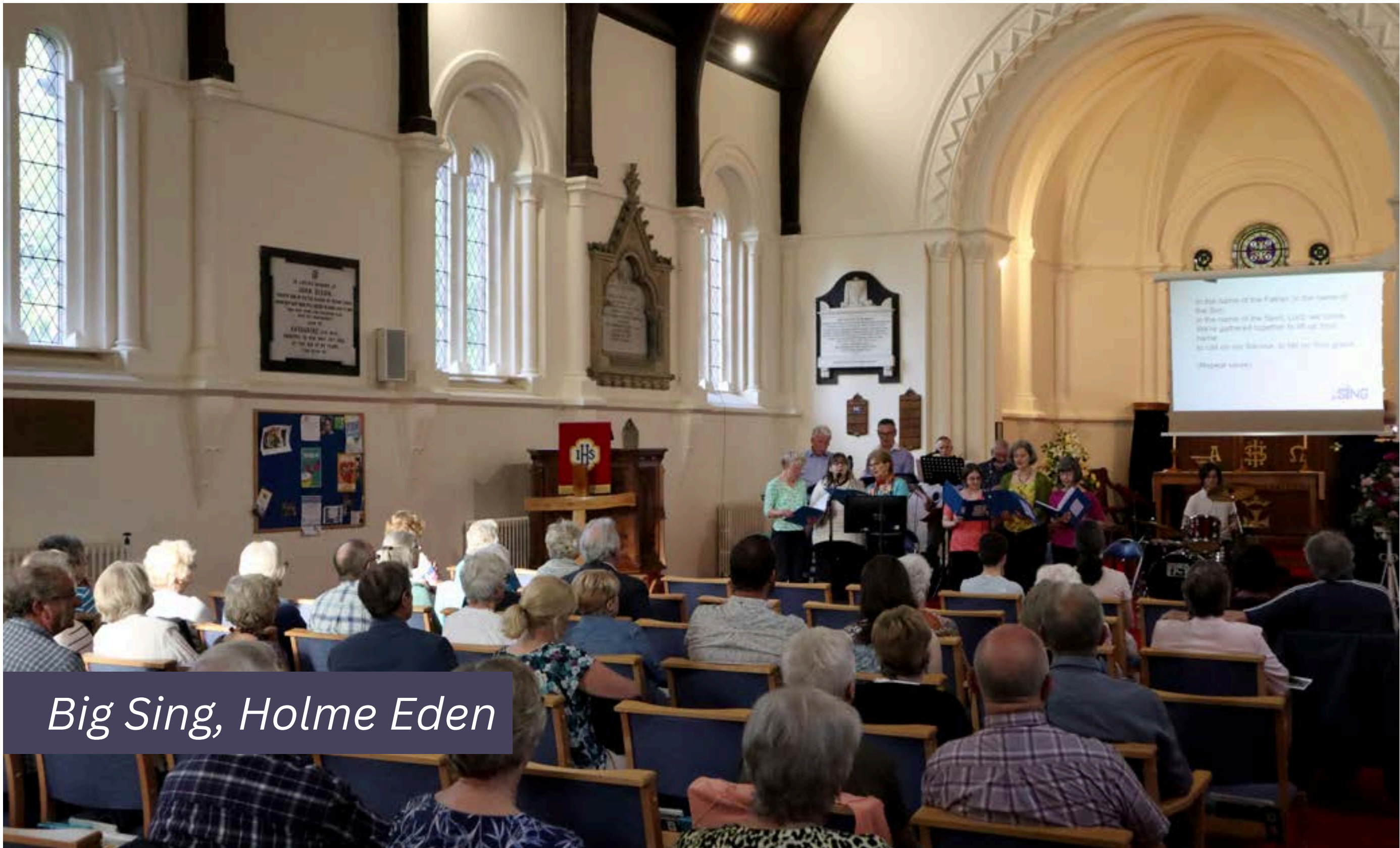
Big Sing, Holme Eden