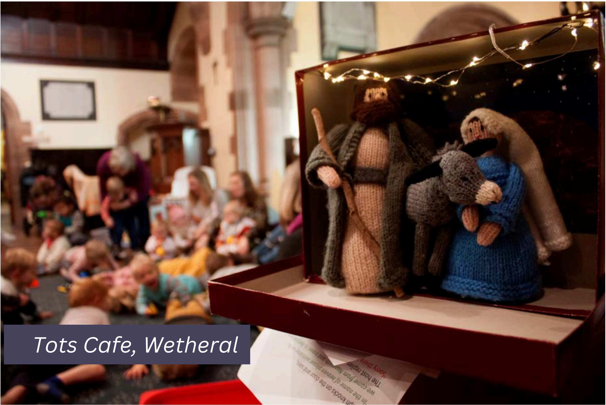
Tots Cafe, Wetheral

Other activities: The Church hosts the weekly Eden Wild Goose Community Choir rehearsals, and the monthly Tots Café, plus various fundraising events and concerts throughout the year, including summer picnics and music nights in the churchyard. These serve the important function of introducing members of the wider community to our wonderful church and its people.