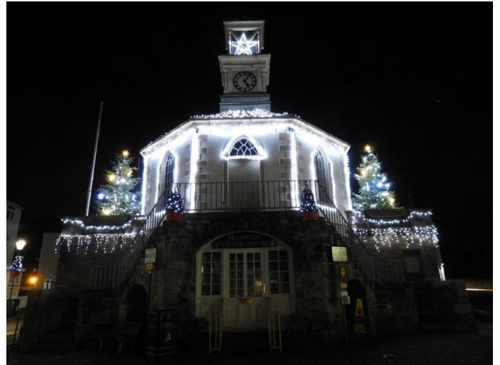
Brampton Moot Hall at Christmas

There are five Church Primary Schools and four Community Primary schools as well as a large Secondary School in Brampton. Clergy have close involvement in the Church schools and all of the Community Schools. The Network Youth Leader goes into the High School most days and takes the lead in youth work in Brampton