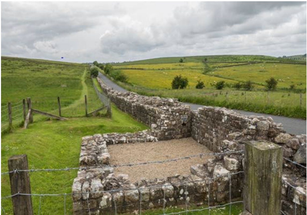
Hadrian's Wall towards Lanercost