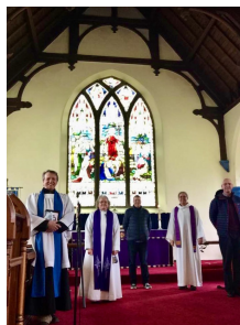
The Covid Lockdown Worship Team