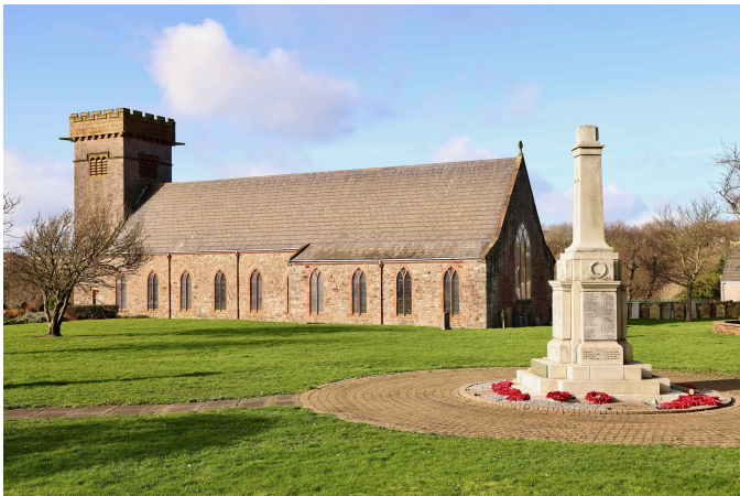
Harrington St. Mary's Church

The overall condition of the buildings and grounds is good. Copies of the latest Quinquennial reports are available for both churches.