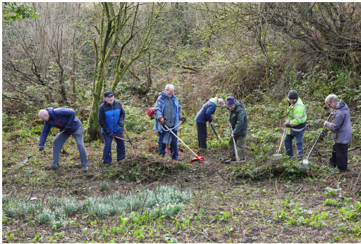
Members of the 'Tuesday Gang' at work