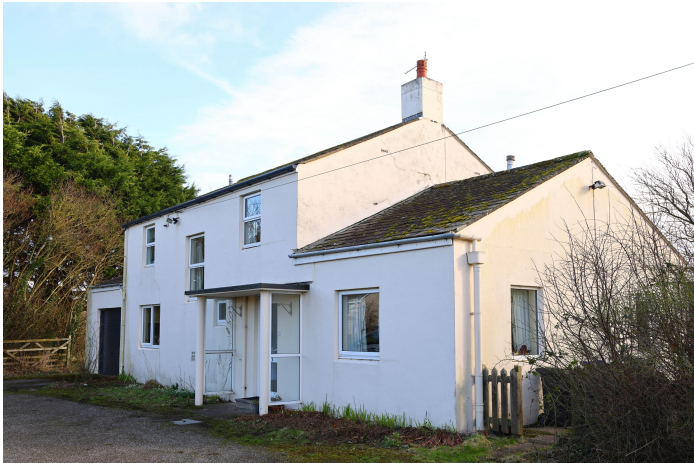
The Benefice House

At Distington, the church has use of the Old Chapel, a former Methodist Chapel that is now part of a joint project between the Anglican and Methodist churches. The chapel currently hosts a Wellbeing Café, as well as coffee mornings and occasional family services. During lockdown it was used for the village Fare-Share scheme.