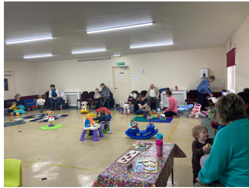
Distington Toddlers Group