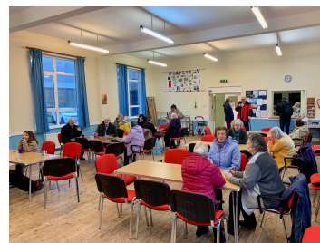
Refreshments after Communion in Harrington Church Hall