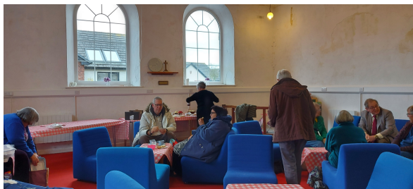
Coffee Morning at Distington Methodist Chapel