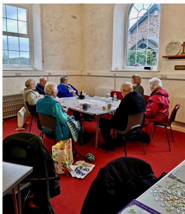
The Renew Wellbeing Café