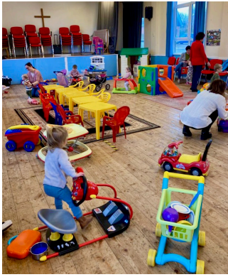
Harrington Pram Club