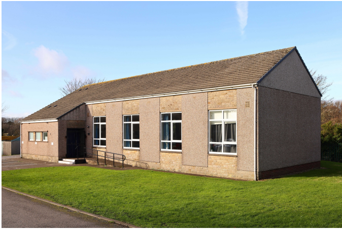
Harrington Church Hall

churchyards have been granted money for re-wilding, i.e., to seed given areas with wild flowers to encourage the presence of bees.