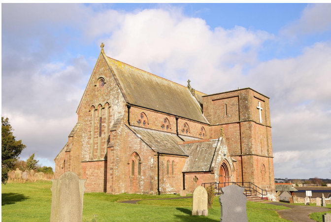
Distington Church of the Holy Spirit

At Harrington church the east window is in need of renovation. The remaining windows have recently been/are being renovated. Upkeep of the church benefits from a volunteer group within the church community.