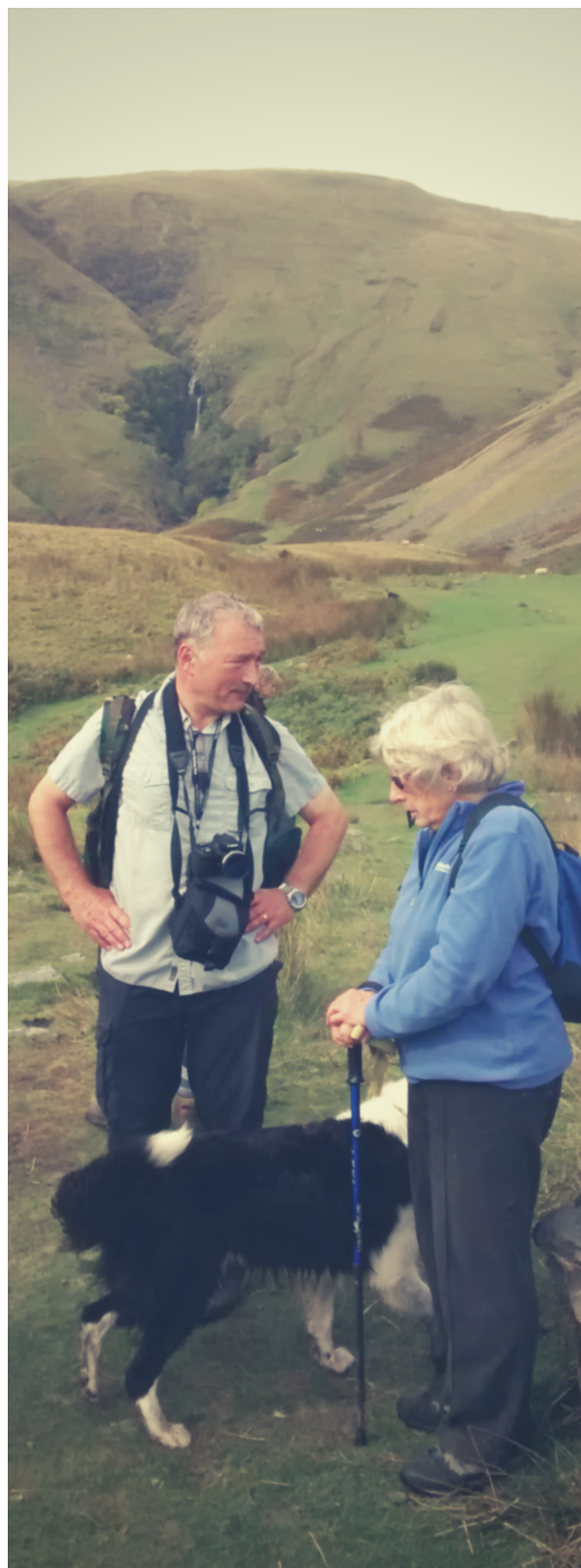
A prayer walk below Cautley Spout

As you read on please know that we are praying for you as you discern whether God is calling you to the Western Dales Benefice.