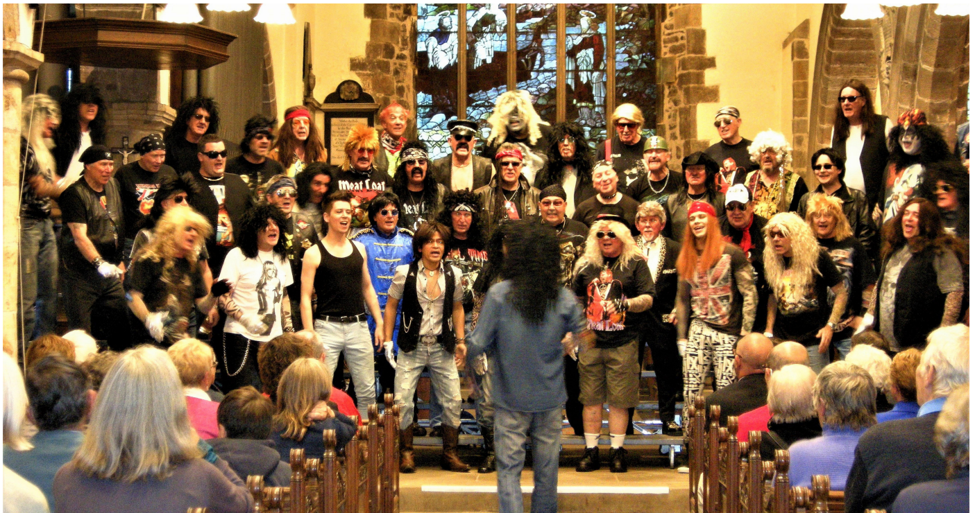
The Cottontown Chorus in concert

Music is quite outstanding in the area, with a biennial Music Festival, an annual Beer and Music Festival in Dent, Sedbergh Brass Band, Sedbergh Orchestra and the Dentdale Choir. For children there is a training band and the Pepperpot children's orchestra.