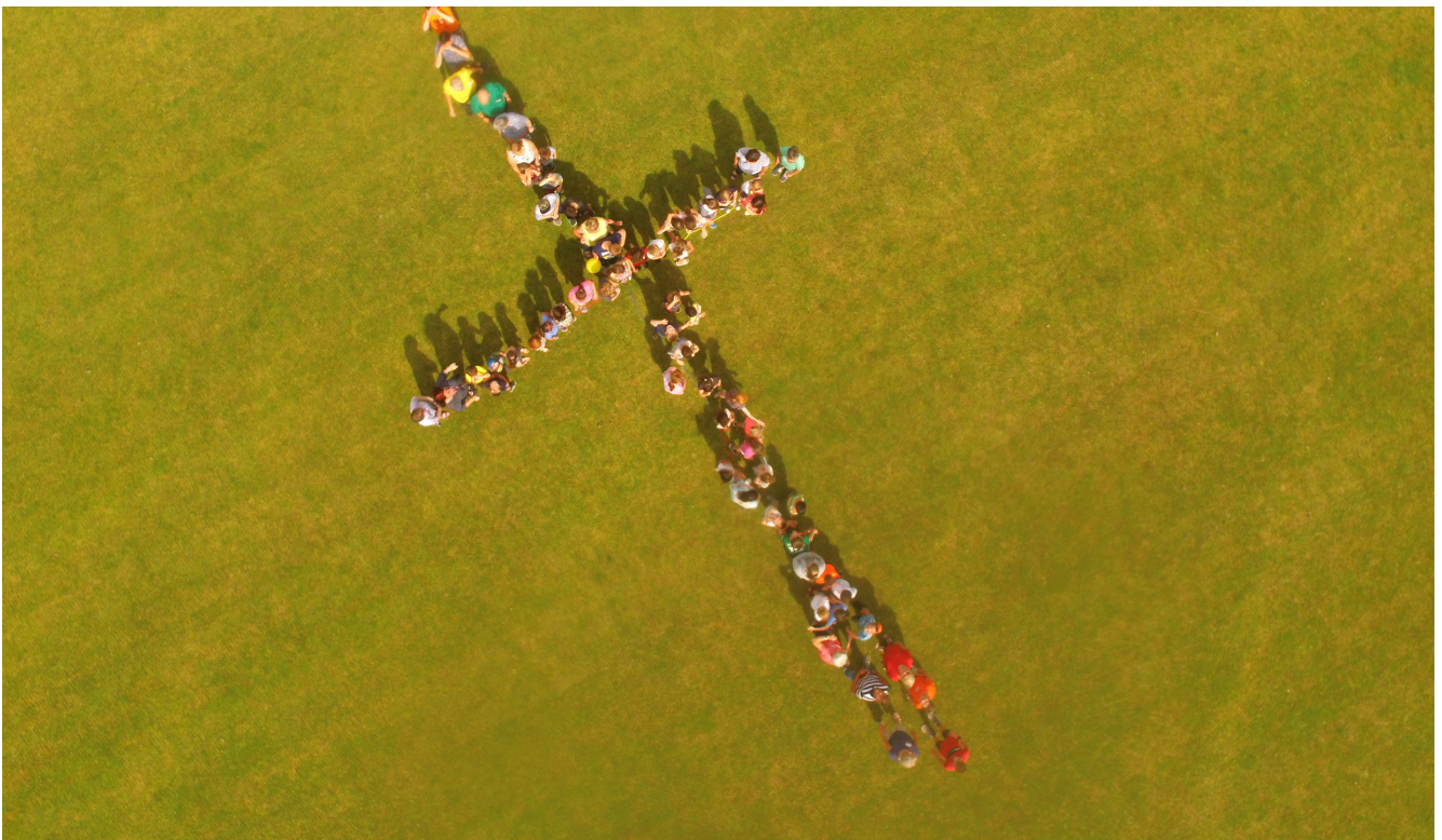
The Holiday Club Living Cross