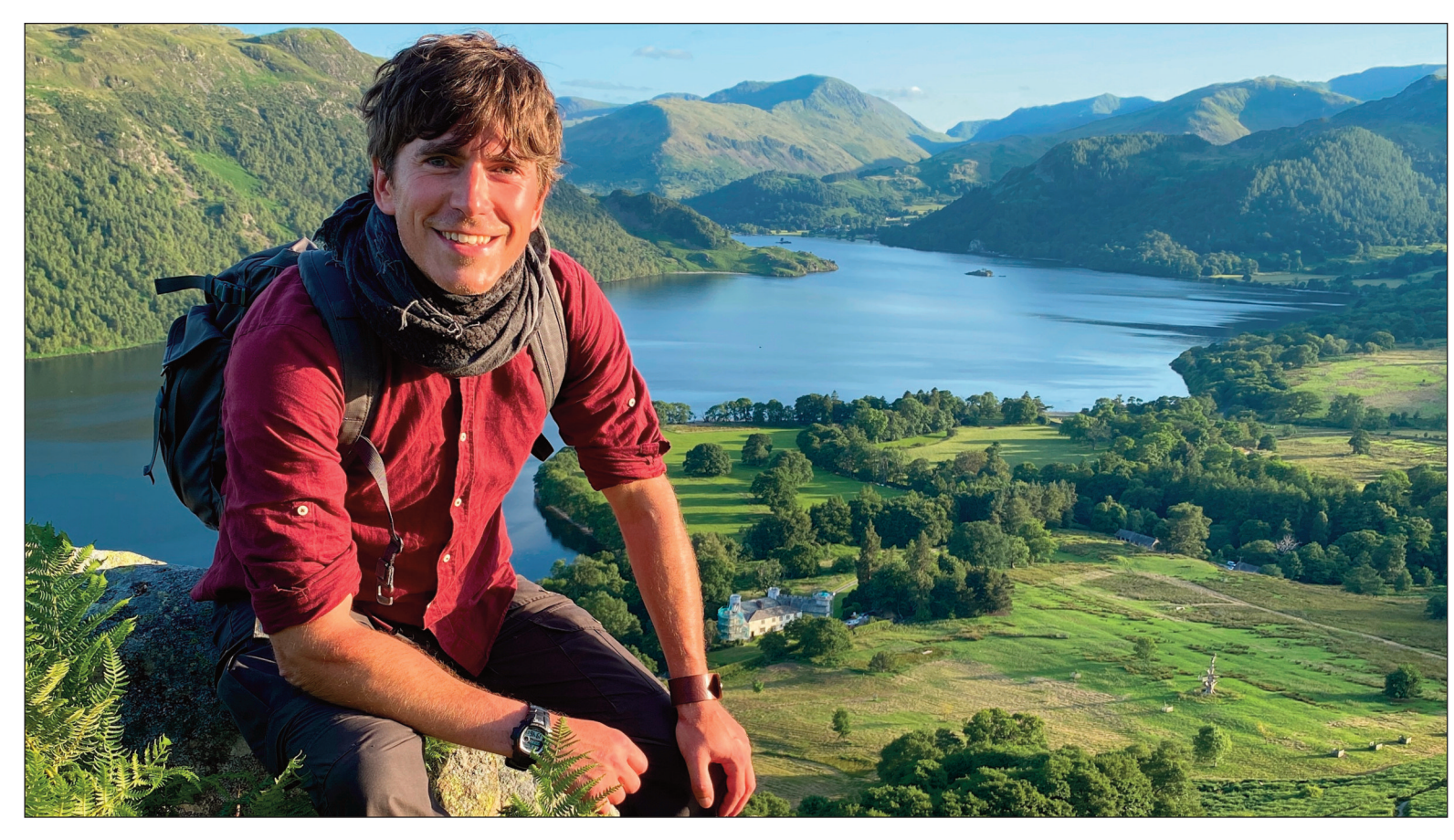
Holidaying at home: Globetrotter Simon Reeve made three episodes of The Lakes

The 2021 champing season has seen more than £3,000 raised, with