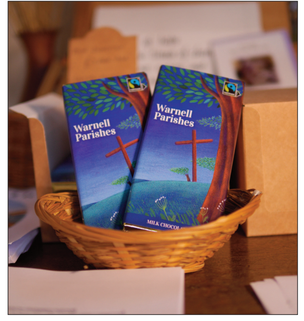
Own brand: People are being asked to donate at least £3 per bar

For more on Meaningful's bars, visit www.fairtouristbars.uk.