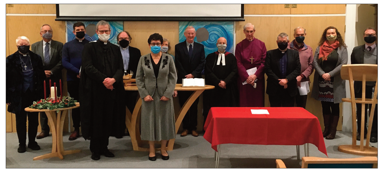
Harmony: Attendees at the Service of Reaffirmation at Keswick Methodist Church