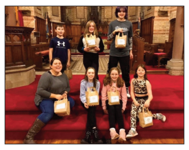
Sharing: NYC members with the special calendars

HUNDREDS of special Advent calendars have been shared with young people by Network Youth Churches (NYC) across the county.